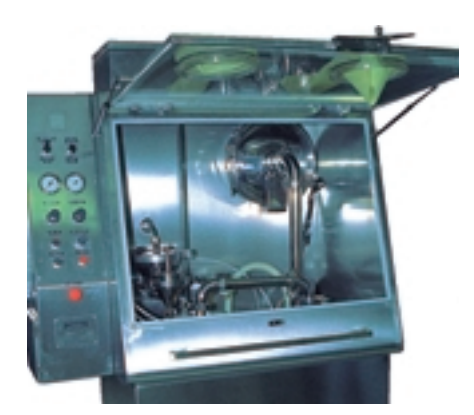
ISOPAK-1, FRONT WINDOW OPENED FOR SERVICING

Process equipment are AISI316 stainless steel and hand polished with extrafine, mirror finish 320-360 grit, Ra 0.25-0.32µm. Super-mirror finish of contact parts, 400-600 grit Ra 0.16-0.25µm is also available.