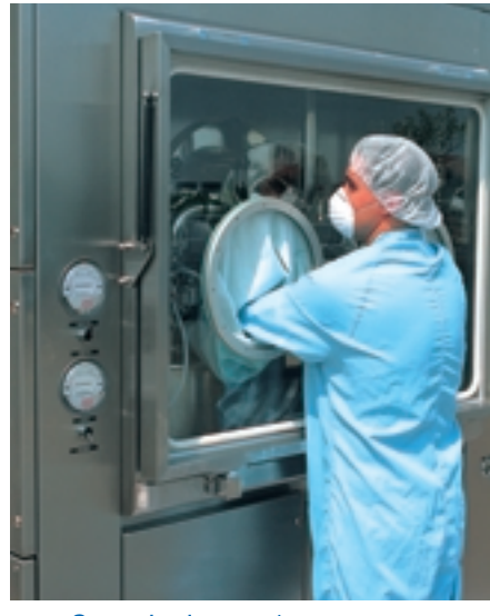
SUPERJET ISOPAK-1, CUSTOMIZED

high-precision, electronic pressure controls that monitor the microniser with proportional pressure regulators, specifically dimentioned for very quick response and steady operation